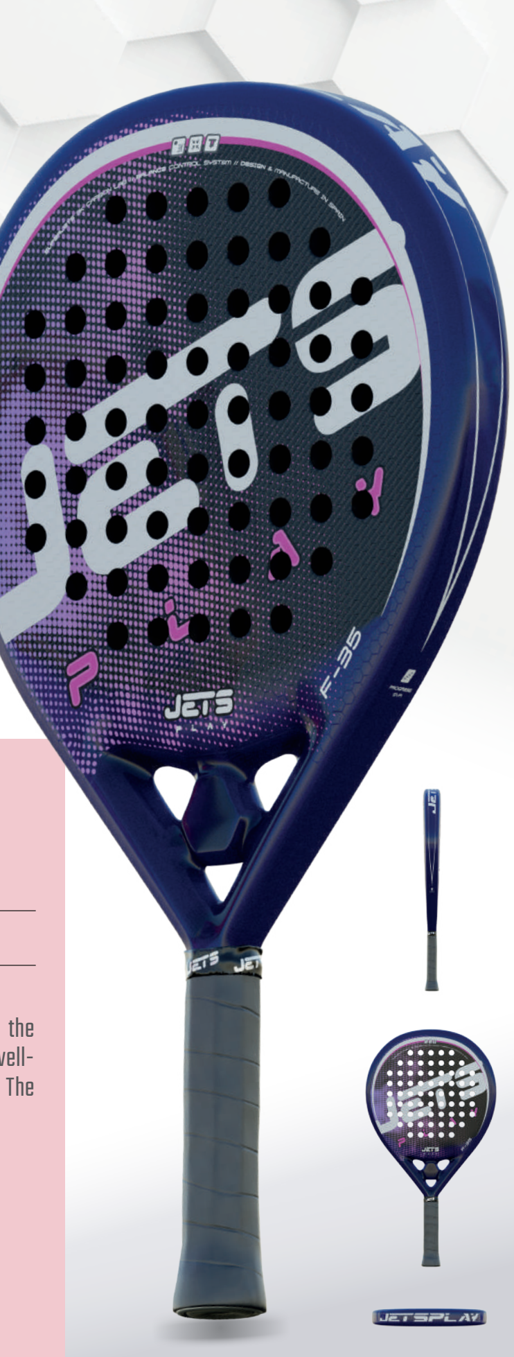
Designed and manufactured in Spain