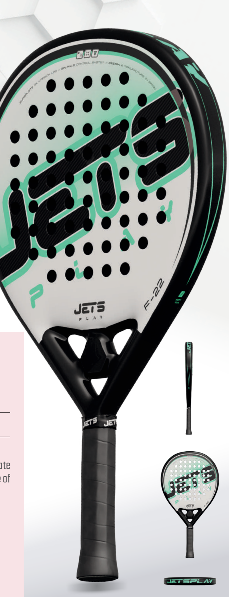
Designed and manufactured in Spain