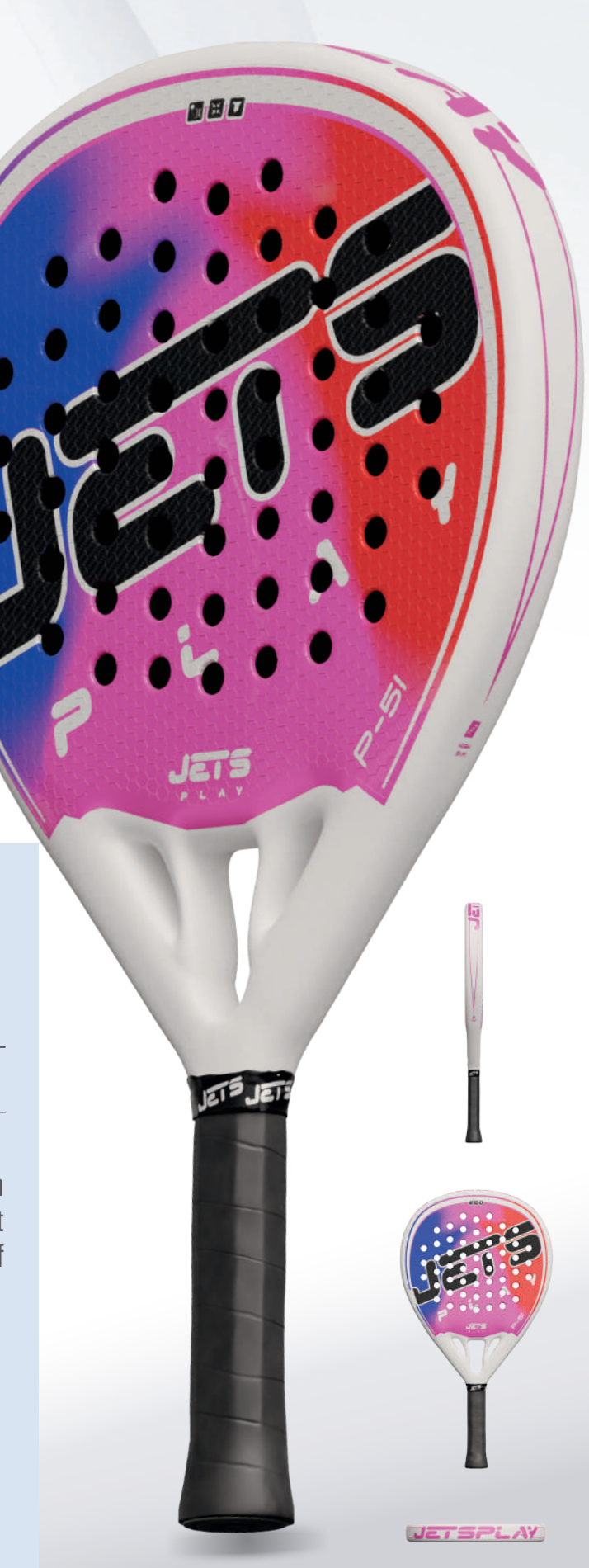
Designed and manufactured in Spain