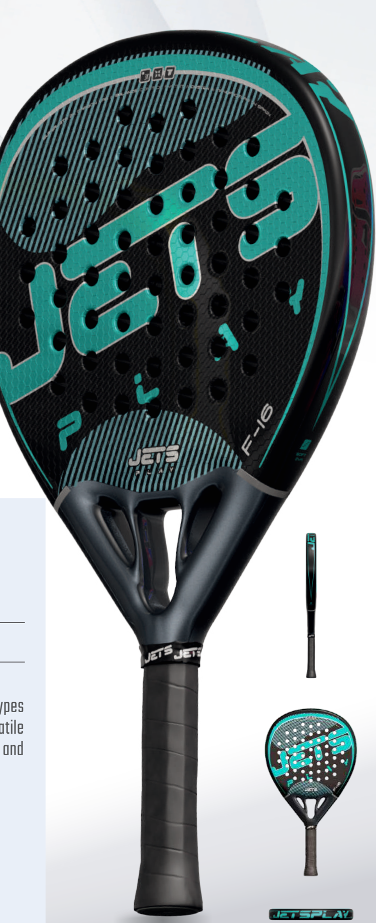
Designed and manufactured in Spain