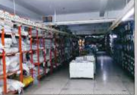
Raw Material Warehouse