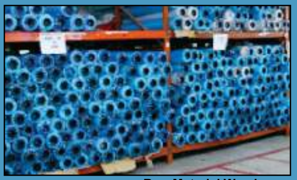
Raw Material Warehouse