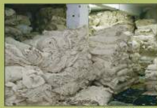
Finished Fabric Storage