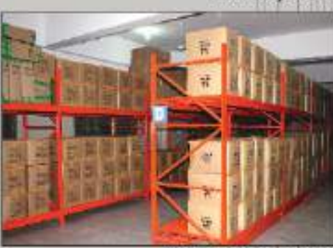
Finished Goods Store