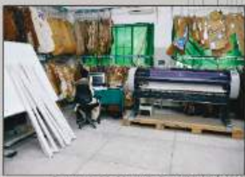
Pattern Making & Pattern Record