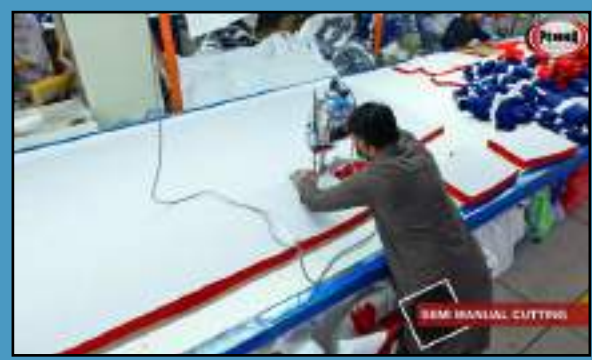
Semi Manual Cutting