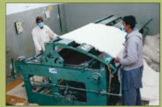
Checking & Folding