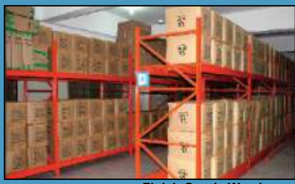
Finish Goods Warehouse