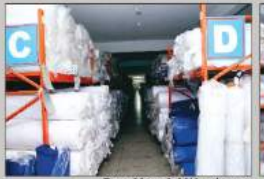
Raw Material Warehouse