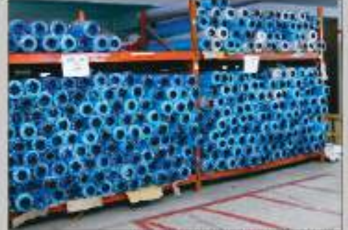
Raw Material Warehouse