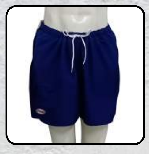
Shorts & Pants