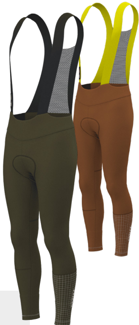
SCOTT RC PRO WARM +++ REMIX MEN'S BIB TIGHTS 423695