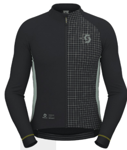
SCOTT RC PRO WARM GORE-TEX REMIX MEN'S JACKET 423691