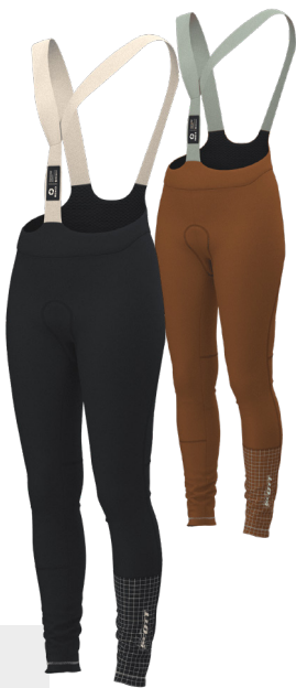
SCOTT RC PRO WARM +++ REMIX WOMEN'S BIB TIGHTS 423696