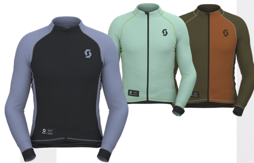
SCOTT PRO WARM LS REMIX MEN'S JERSEY 423693