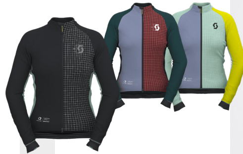
SCOTT RC PRO WARM GORE-TEX REMIX WOMEN'S JACKET 423692