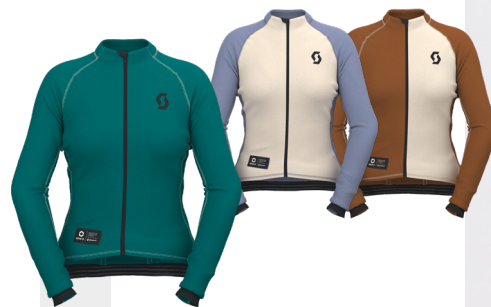
SCOTT RC PRO WARM LS REMIX WOMEN'S JERSEY 423694