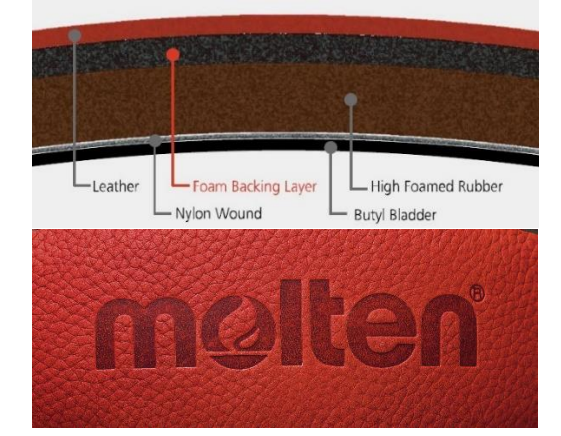
Original Leather Texture Surface Average texture top area @ 5.33mm<sup>2</sup>

Conventional Pebble Surface Average texture top area @ 2.74mm<sup>2</sup>