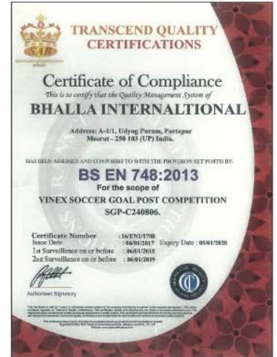
BS EN 748:2013 Soccer Goal Post