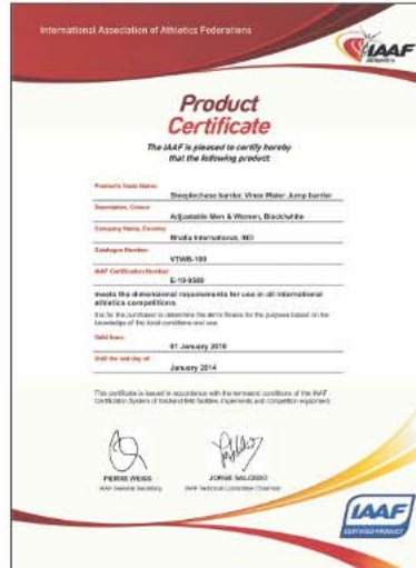
100+ IAAF Certified Athletic Equipment