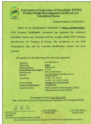
FITB Approved Tchoukball Frame